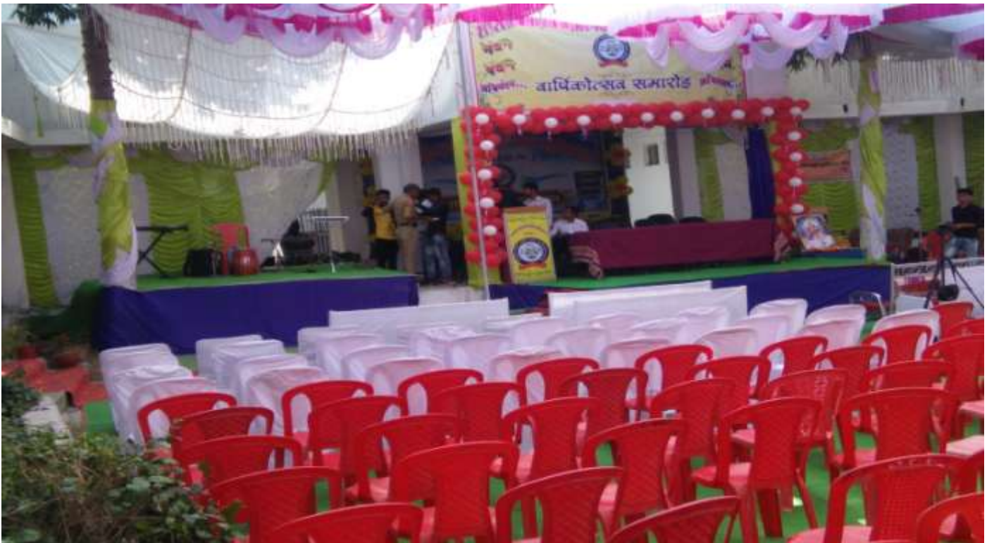
वार्षिकोत्सव समारोह दिनांक 05.02.2019