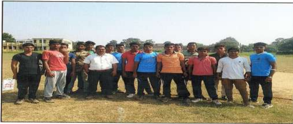
College Playground (Sports Program) Year 2016-17