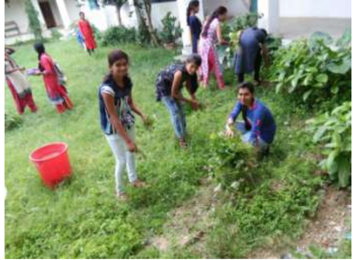
स्वच्छ भारत अभियान दिनांक 24.09.2018