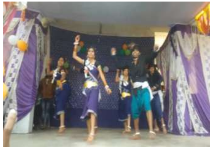
College Campus (Cultural Program) Year 2016-17