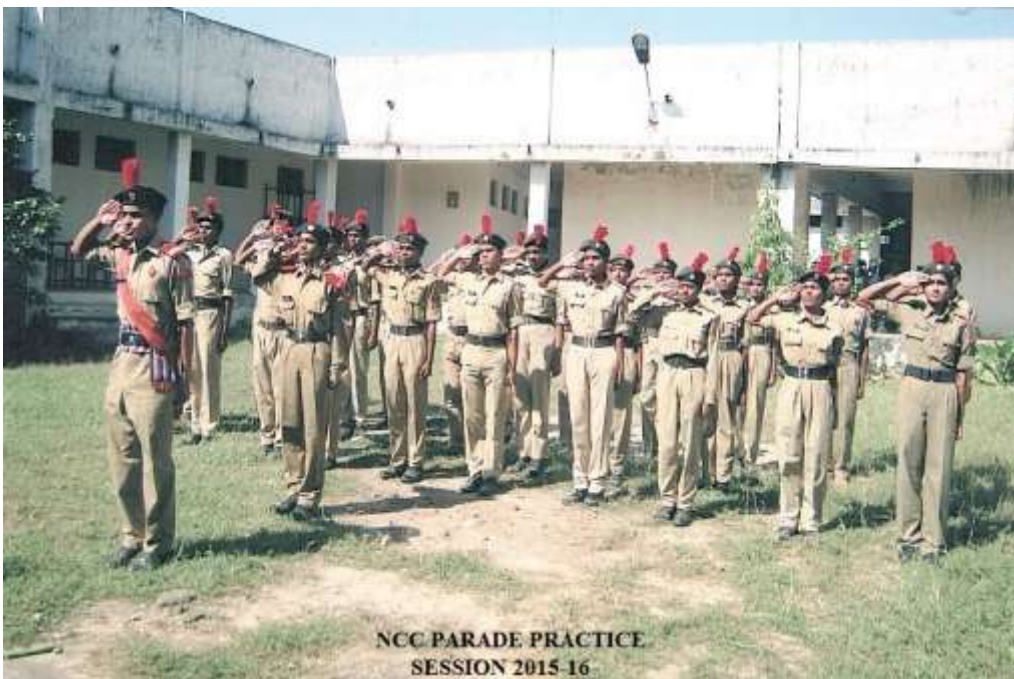
NCC PARADE PRACTICE SESSION 2015-16