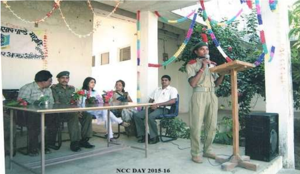
NCC DAY 2015-16